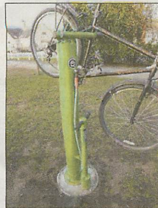
A concrete base for a bicycle repair stand, which was donated by the North Shore Cyclists, was poured earlier this month. The stand is located south of the Topsfield Main Street crossing.

A concrete base for a bicycle repair stand that was donated by the North Shore Cyclists was poured earlier this month. The stand is located south of the Topsfield Main Street crossing. Tools on the stand include an air pump and hand tools including wrenches, screwdrivers, etc. The value of the gift was more than $1,000 Geller said.