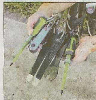
Tools on the stand include an air pump and hand tools including wrenches, screwdrivers, etc. The value of the gift was over $1,000!